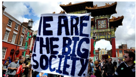
Thousands marched in Liverpool over pensions changes

The Green Party supports the right of Trade Unions who have a democratic mandate to strike to do so. While we recognise that children and parents were affected, we agree that in this case, there really is no other course of action left for teachers, lecturers and other public sector workers, if the government continues to refuse to negotiate in good faith.